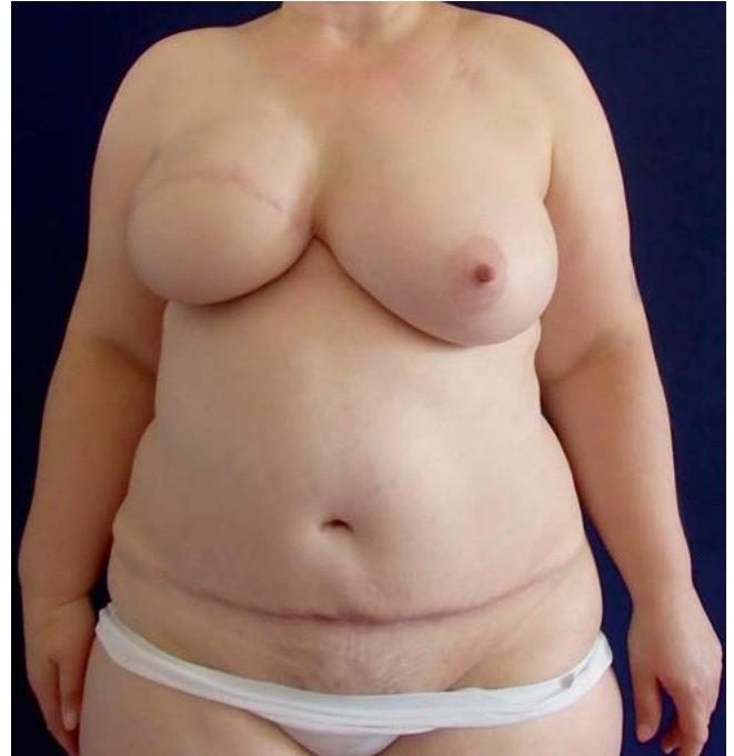
► Fig. 4 Surgical site 6 weeks postoperatively.

ranged from 1 (not at all) to 4 (a lot). Pain history was documented using a numerical rating scale from 0 (no pain) to 10 (strongest pain). A follow-up took place at week 1 and 6 as well as 6 months postoperatively. Measurements were always taken at the same time of day (2-hour range) to avoid daytime variations in the lymphedema.