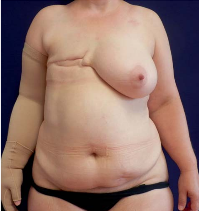
► Fig. 2 Preoperative site.