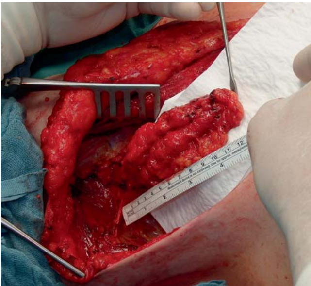
► Fig. 3 Incised turnover flap before transposition into the axillary region for re-augmentation of the volume deficit following scar tissue excision.

ranged from 1 (not at all) to 4 (a lot). Pain history was documented using a numerical rating scale from 0 (no pain) to 10 (strongest pain). A follow-up took place at week 1 and 6 as well as 6 months postoperatively. Measurements were always taken at the same time of day (2-hour range) to avoid daytime variations in the lymphedema.